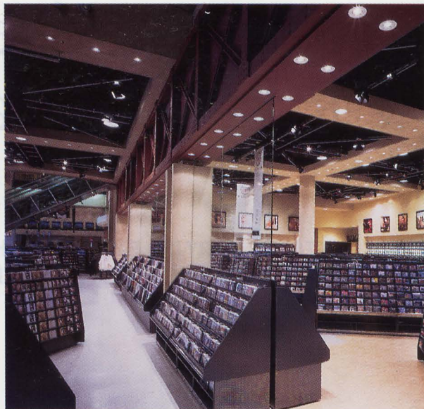
Although the curved forms and building-within-a-building ideas remain, the neoclassical and fantasy-ruin antecedents have largely disappeared. VJ booth (far left) and ground floor (left).