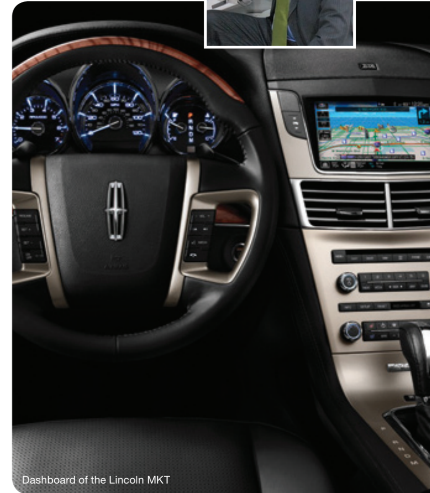
Dashboard of the Lincoln MKT