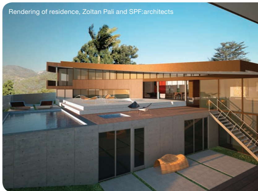
Rendering of residence, Zoltan Pali and SPF:architects

Thomas: I also have three favorite points in a design. The first is coming up with the magic sketch. The second is building up the actual technical packaging, the problem-solving aspect of the design. And my final favorite part is when I get to experience the finished product firsthand.