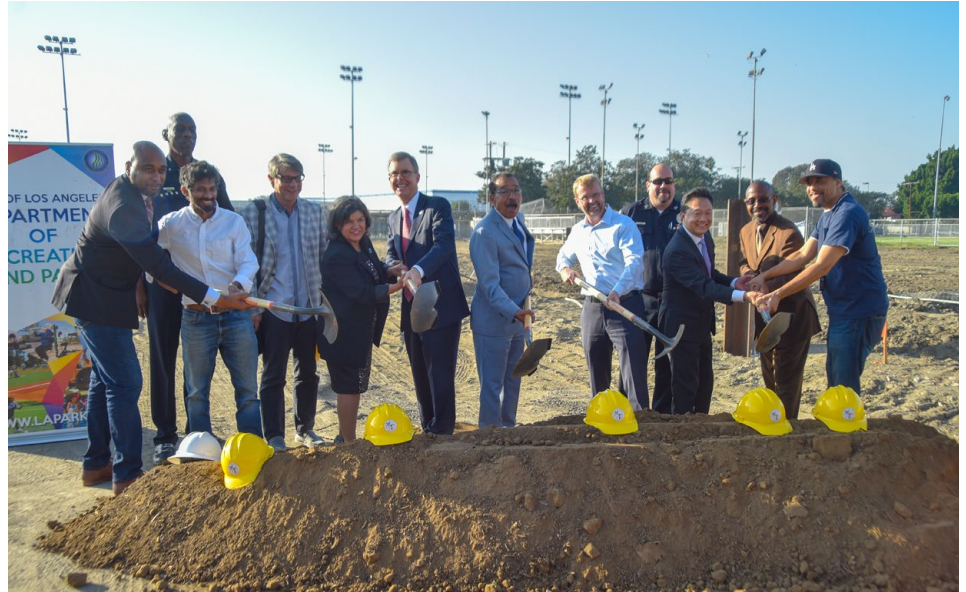
City Council President Herb Wesson led the groundbreaking ceremony.

The project will rehabilitate the existing