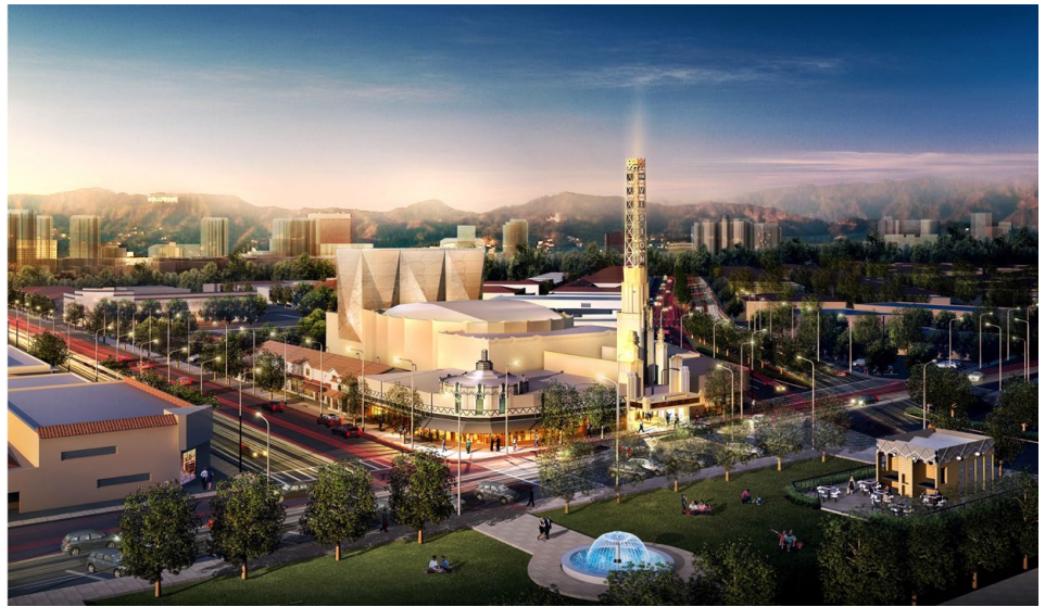
Rendering of what the Vision Theatre/Manchester Junior Arts Center project will look like when completed.

The Vision Theatre construction project is an elaborate undertaking. The highlights of the building expansion and rehabilitation include a building expansion of 20 feet to the back of the theatre building. Other parts of the scope include the construction of a new fly tower with subterranean, orchestra pit, new stage, seismic retrofit, historical repair and restoration of audience chamber, installation of new and restored auditorium seats, mechanical, electrical and plumbing upgrades, and fire life safety infrastructure and finishes necessary for a functioning theatre.