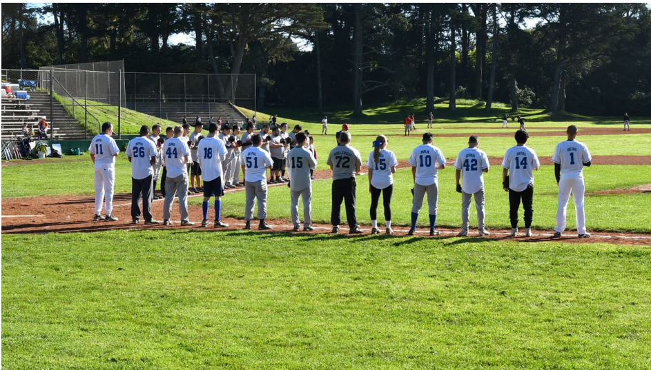
Teams line up for the National Anthem.