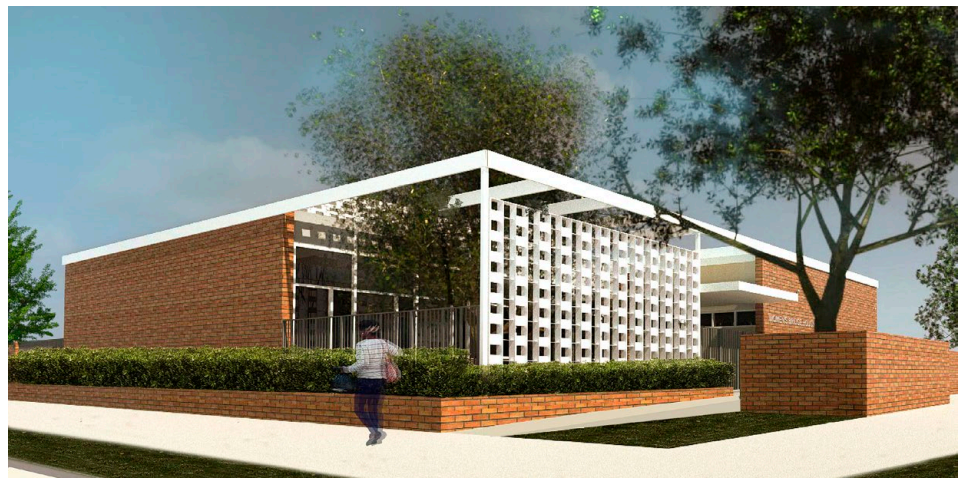
Rendering of the exterior