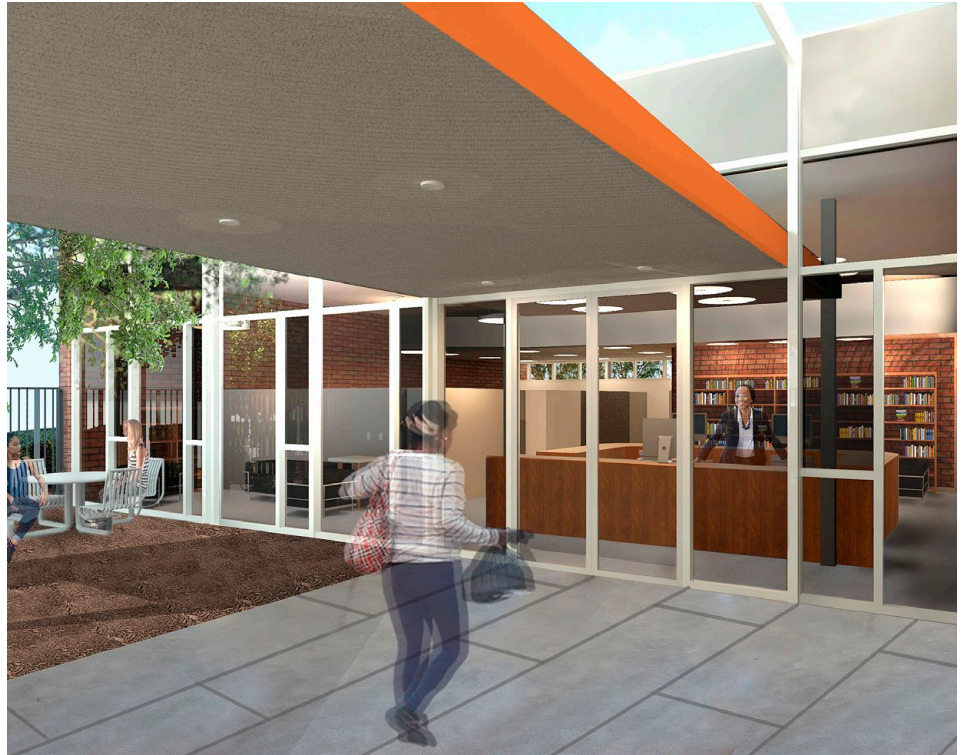
Rendering of the welcoming entry courtyard.