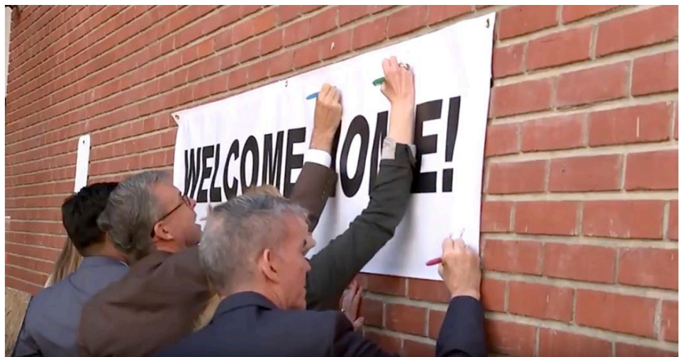
Writing messages of encouragement on a banner that will welcome the first new residents.